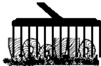
Figure 3 Grooming – Soils now in Solution "Appears" Clean

5. Drying. If cleaning is proper and drying is complete, fabric surface appears clean (Figure 5). Often, however, spots reappear [usually the result of incomplete soil extraction (Figure 7) in 3-5 days, or spotter detergent residue (Figure 6) in 2-3 months]. The spot must be re-cleaned and blotted as a dryer is used by the customer. The absorbent will collect any soils not first extracted. Volume spills may require 3, 4 or more cleanings.