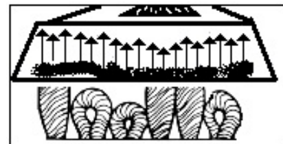
Figure 4 Our Extraction uses Rinse with Encapsulation, Extra Dry Passes Our Wand has a Window for visibility!

3. Grooming (Figure 3). TAMPING disperses loosened soil into the solution. The fabric looks clean immediately from the surface if spotter is working. For smaller spots, ALWAYS use the brush like a hammer, the effect is many times more effective.