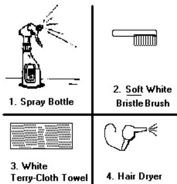
Figure 1 Simple Spotting Kit

1. SETTING UP a Spotting Kit (Figure 1). You will first need a 24 oz or similar spray bottle for each spotter required. Always pretest 'until dry' each product before first use. Use a clothes spotting super-market detergent ('enzyme-labeled' like Shout™ ), or, if a concentrate, use greatly diluted (½ teaspoon for above size bottle) Second , you will need a soft brush for 'tamping' agitation. Third , you will need white terry cloth towels for blotting absorbent. Fourth , to speed things up, you will need a hair dryer. Keep the kit readily accessible. 2. Preconditioning (Figure 2). The spotter is sprayed onto the soiled item. Use sparingly, allow 5 min. dwell time! As it is sprayed down, it surrounds and softens most soil. Apply more solution only if spot is removing, or soil is great.