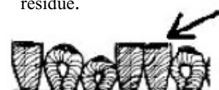
Figure 7 An incomplete rinse yields returned spots. Fiber tips are last to dry.

Sometimes the absorbent can be left to dry on the fabric overnight, in that case. Any moisture not removed within 48 hours will cause mold and mildew to appear. ‡ See "DRYING" on back side. Figures 5, 6, & 7 highlight the importance of regular deep EXTRACTION CLEANING! Soil DOES wick up from sub floor, pad & carpet backing. Extraction addresses also indoor air quality issues. YOU BREATHE EASIER! CONSIDER OUR FABRIC PROTECTION OPTION! Protecting your carpet makes cleaning it in between visits easier for you not to mention the value preservation it adds to your carpet investment. Ask us for a demonstration if you have not seen it online.