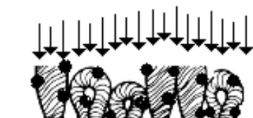
Figure 2 Soiled Fabric Being Reconditioned, High Pressure, Hot Water & Fit Detergent